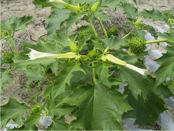
Jimsonweed, showing leaves, flowers, and seed pod.